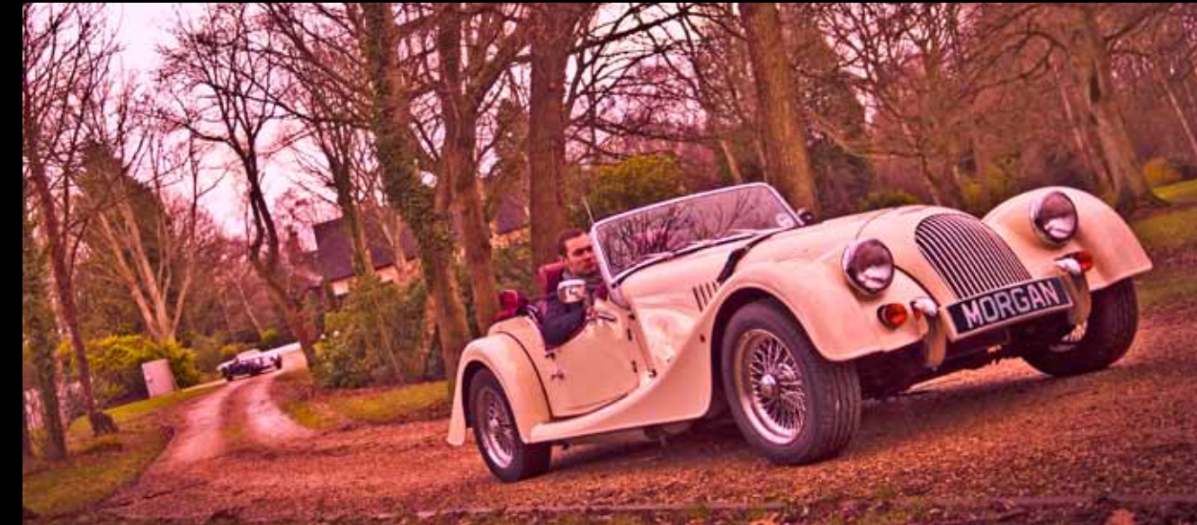
Bespoke specification Plus 4

Whichever route you chose the excitement will begin the day you decide to buy a Morgan sports car.