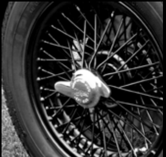
Black wire wheels