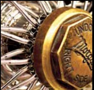
Polished wire wheels