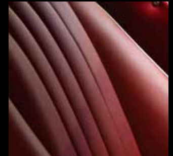
Several leather choices