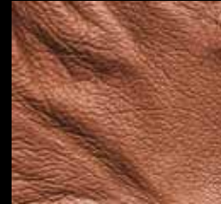
Saddle Brown Leather

*All Colours are printed representations.