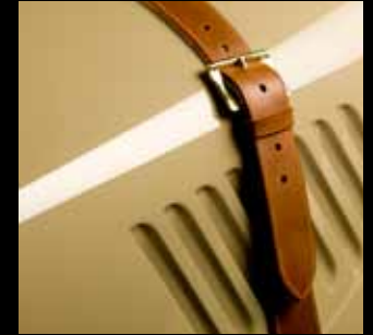
Bonnet strap detail